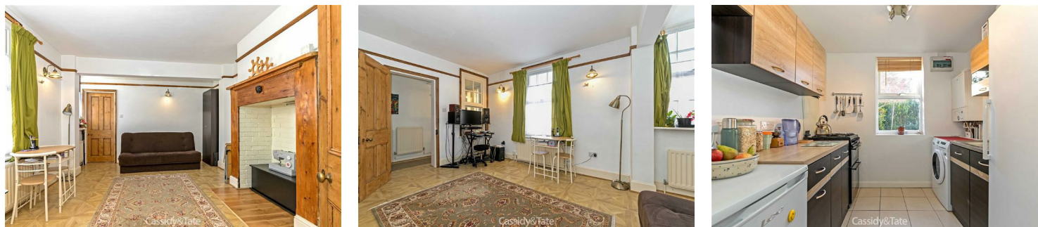
GROUND FLOOR APPROX. 50.8 SQ. METRES (546.4 SQ. FEET)

This one bedroom period maisonette conversion will make the perfect home for a professional/commuter or an ideal investment purchase as it is a stone's throw away from the mainline railway station, linking St. Albans to London, St. Pancras and is a short walk to the city centre. The property is presented in good decorative order throughout and benefits from a 15' lounge/dining room, a fitted kitchen, bathroom and a double bedroom. Further features include a private garden to the rear of the property and an allocated parking space. St. Albans is a vibrant city with a twice weekly market and an extensive range of shopping and leisure facilities as well as many cosmopolitan bars and many eateries